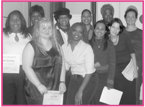
The spring 2004 volunteer class at their graduation ceremony

During 2004, WIT held 6 group cycles (each cycle is approximately 7 weeks long) which consisted of 325 group sessions . Through the groups, WIT provided 452 women - an increase of 11% from FY'03 - with 5,088 hours of in-person and telephone follow-up service related to the support groups. These numbers include women who attend WIT's Information & Education (I&E) groups - which use the format of our Safe & Sober Lifeline Peer Support Group but are held off-site at women's treatment programs and are facilitated by our Substance Abuse Counselor.